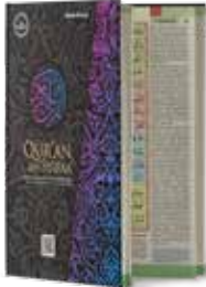
Biru - Pink Blue - Pink

Tersedia dalam 4 warna: Available in 4 colours: