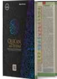
Biru - Ungu Blue - Purple