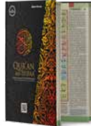
Merah - Kuning Red - Yellow

Al-Qur'an hafalan, terjemah, dan tajwid berwarna dengan metode Tikrar. Menambah keberkahan dalam bisnis HNI.