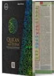
Hijau - Biru Green - Blue